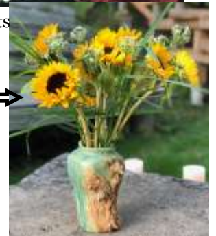
Melody Green's vase