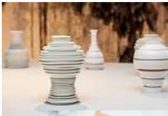
George's Deconstructed pots