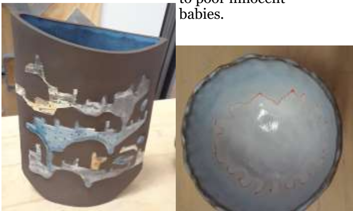
A few of the finished pieces snapped up by attendees