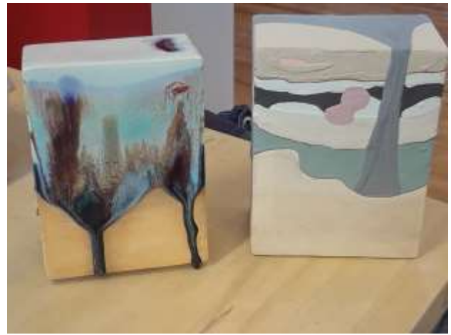
The before (right) and after (left) glaze firing of her wall boxes. The landscape design is quite evident before firing but obscured as the glazes run and meld together

Saturday and Sunday were spent watching and marvelling at her skill in assembling her hand built and thrown sections into beautiful envelope vases, wall boxes, triangle bowls. Sunday, we watched her glaze a few of the bisqued pieces she brought with her. Baby ear syringes filled with an assortment of glazes were used to carefully fill in her landscape sections. I know that there has been a run on baby ear syringes in drug stores in London, probably prompting worrying questions as to what people are doing to poor innocent babies.